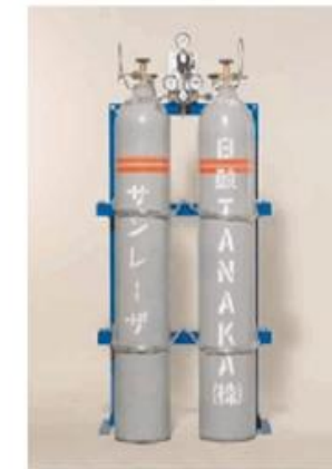
Laser Gas Supply System for Stable Gas Supply to CO 2 Laser Cutting Machines

Hydrogen gas cutting significantly reduces CO 2 emissions and fuel gas consumption, making it an essential solution for a carbon-neutral society. We conduct on-site demonstrations.