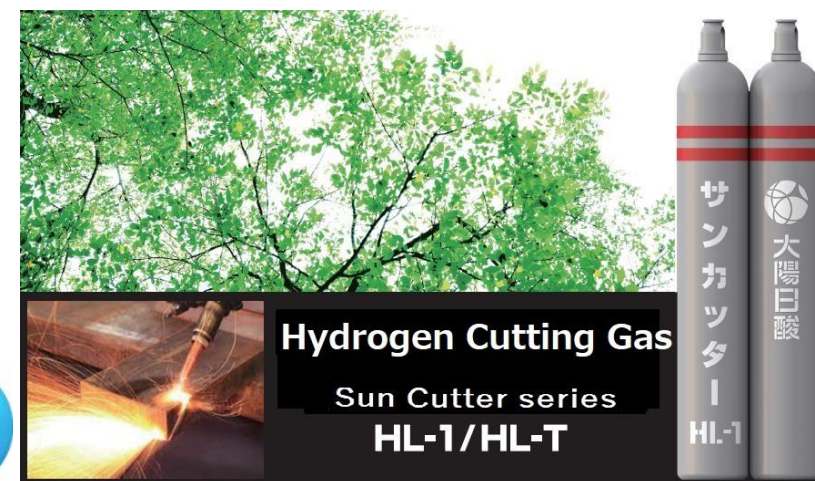
Hydrogen Cutting Gas Sun Cutter series HL-1/HL-T