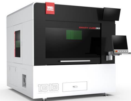
Compact Fiber Laser Processing Machine with Outstanding Cost Performance [SMART CUBE]