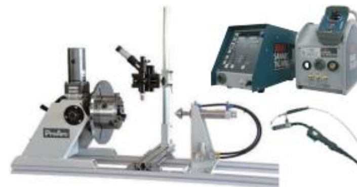
High-Efficiency Semi-Automatic TIG Welding System [Sanarc TIG Meister] Equipped Rotating Pipe Welding System Package