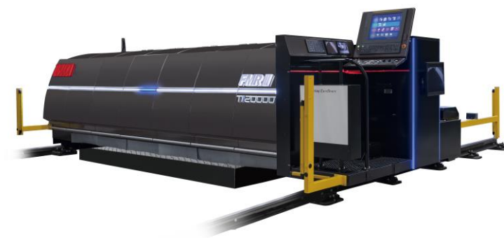
The latest fiber laser cutting machine “The All-New” that revolutionizes cutting [FMR III]

With sales offices in China and the U.S., we are expanding our sales activities in Korea, the U.S., and the Southeast Asian region, focusing on laser cutting machines.