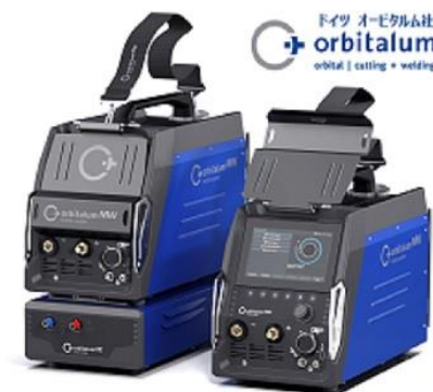
Orbitalum Automatic Pipe Welding Machines for High-Purity Pipe Welding in Semiconductor and Other Fields

In welding system engineering, we leverage our proprietary technologies to propose integrated system packages that incorporate peripheral equipment to address customer challenges. We can also offer collaborative robots and various other automation solutions.