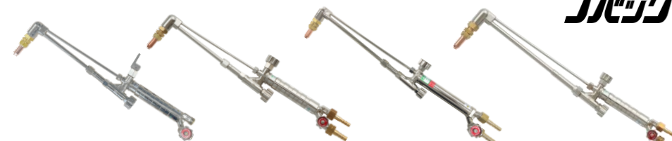
Medium Cutting Torch Z Trigger Medium Cutting Torch Z Medium Cutting Torch U45 II A Type Cutting Torch Z