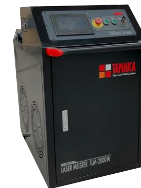
Fiber Laser Welding Machine with Three Functions: Welding, Cutting, and Cleaning [FLM-2000W]